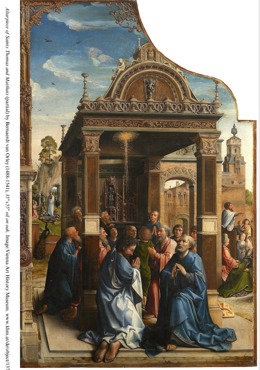
Altepiece of Saints Thomas and Martinus (partially) by Bernardus van Orley (1488-1541), 33"x55" oil on oak.

Seventh Sunday of Easter May 12, 2024 10:00 AM